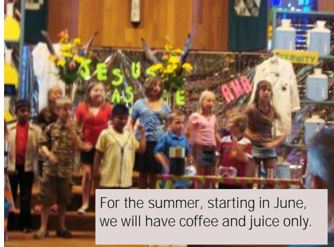
For the summer, starting in June, we will have coffee and juice only.